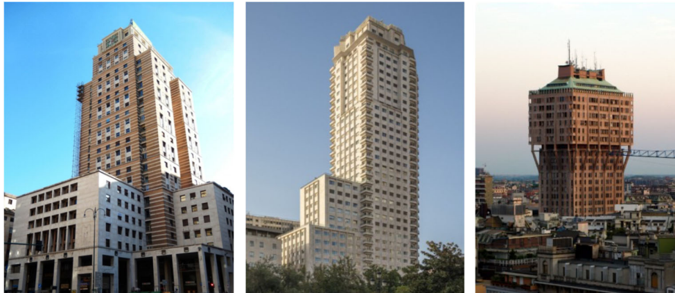
Figure 2. From left to right: Torre Piacentini , Genova, 1940; Torre de Madrid , Madrid; 1957; Torre Velasca , Milan 1958

mass can be categorized as their main energy consumption characteristics. In terms of shape, the tall buildings had compact forms with boxy shapes. These characteristics of compact and boxy shape were best reflected in Torre Velasca and Torre de Madrid (see Figure 2). There is no reliable data available to suggest the U-Value of the external envelope for the tall buildings built in this period, building standards started to improve in 1970 in East part of Europe and mostly in the UK.