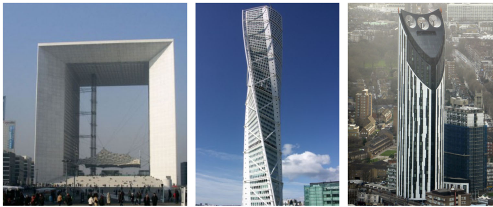
Figure 4. From left to right: La Grande Arche , Puteaux, 1989; Turning Torso , Malmo, 2005; Strata Tower , London, 2010 (Images from CTBUH, 2019)

Furthermore, the introduction of stricter building standards like Passive house standard in 1998 has caused a shift toward lower U-Values and air tightness, more efficient usage of Heating, Ventilation, and Air Conditioning (HVAC) systems and construction detailing to minimize heat loss through thermal bridge. The standard has spread around the world and recently the world's tallest building made by Passivhaus standard is built in Bilbao, Spain in 2018 claiming to have the air tightness of 0.3 m 3 /(m 2 ·h) @50 Pa and a U-Value of 0.1 for the envelope and consume only 7 kWh/m 2 per year (Passive House Institute, 2008).