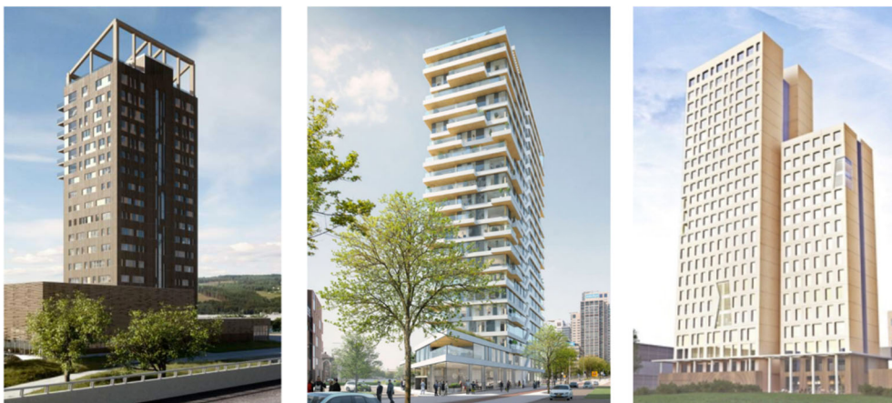
Figure 5. From left to right: Mjøsa Tower , Brumunddal; HAUT , Amsterdam; HoHo , Vienna, 2018 (Images from CTBUH, 2019)

Moreover, nZEB-directive in Europe was introduced aiming to reduce the CO 2 emissions of all new buildings to nearly zero by 2020. Reductions can be realized by shifting the focus on the materiality of construction to wood (Hafner, 2014; Hildebrandt, Hagemann, & Thrän, 2017). Wooden skyscrapers are estimated to be around a quarter of the weight of an equivalent reinforced-concrete structure as well as reducing the building carbon footprint by 60–75%.